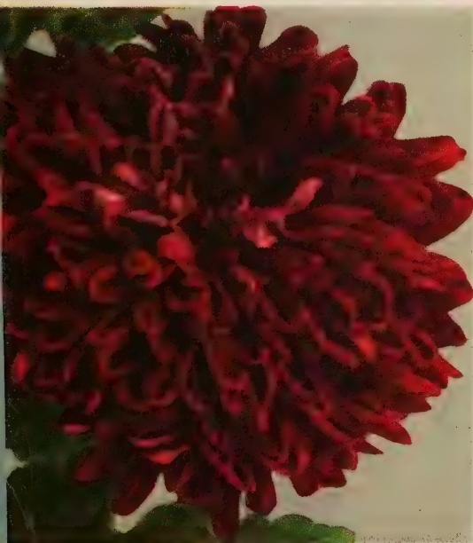
SUCCESS. $1.00 each; 3 for $2.50

8 Sure-to-Bloom Plants (1 of each pictured) $3.80